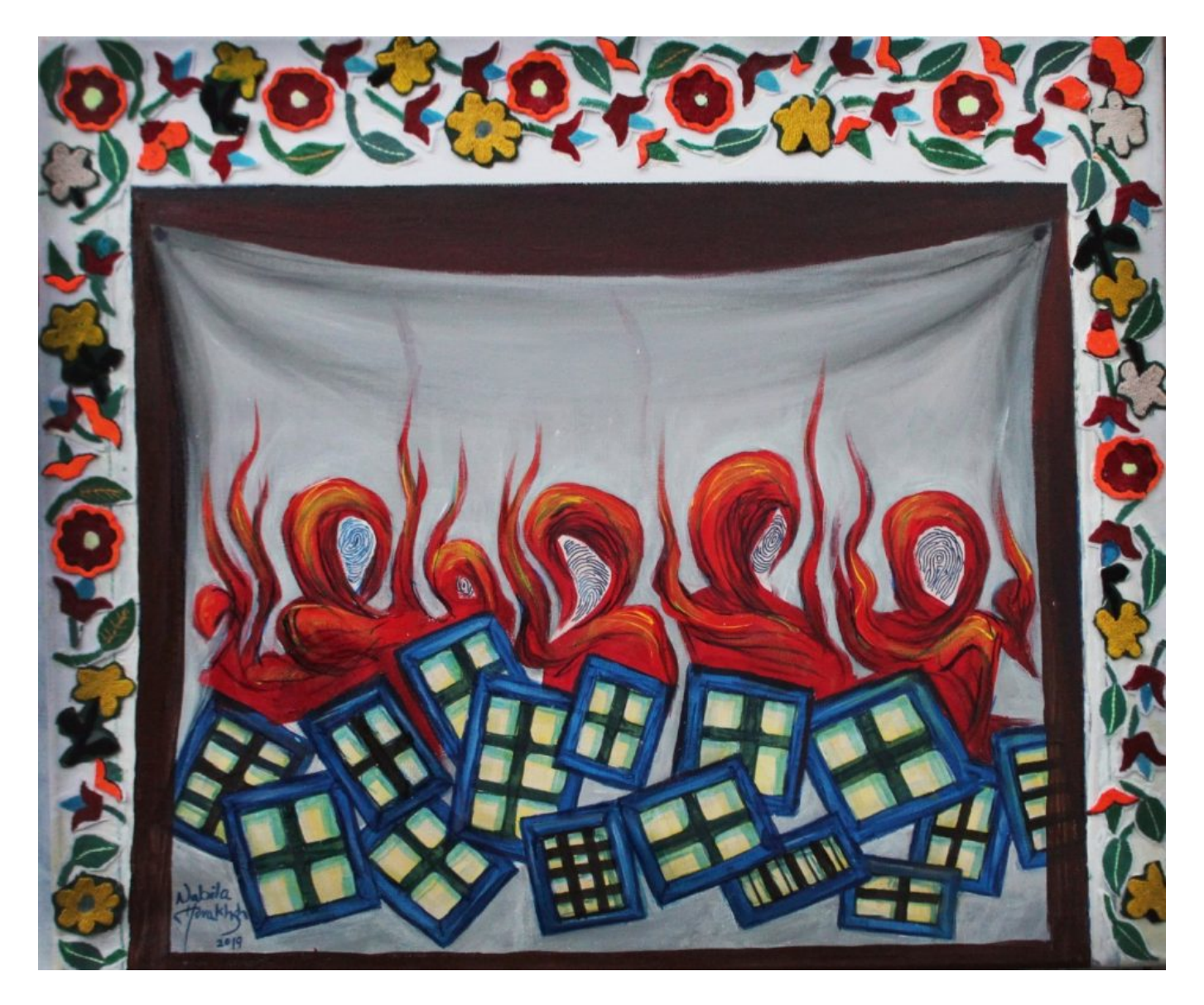
Nabila Horakhsh (Afghanistan), Windows, 2019.

Despite many attempts to redefine the term 'refugee', it remains in international law as a term related to persecution and not to starvation. The three men in Agadez, for instance, did not face persecution in line with the 1951 Convention, but they suffered greatly in a country wracked by a long-term economic crisis. This crisis emanated from the following elements: an initial chunk of debt inherited from British rulers; further debt from the Paris Club of creditor countries used to build infrastructure neglected during Nigeria's colonial past (such as the Niger Dam Project); more debt compounded by internal borrowing to modernise the economy; the theft of royalties from Nigeria's considerable oil sales. Nigeria has the tenth-largest oil reserves in the world, but a poverty rate of around 40%. Part of this scandalous situation is due to extreme social inequality: the richest man in Nigeria, Aliko Dangote, has enough wealth to spend $1 million a day for forty-two years. The three men in Agadez have just enough money to cross the Sahara, but not enough to cross the Mediterranean Sea. As I spoke to them, the thought loomed over me that they would likely fail at their first hurdle. What lay before them was the struggle to return home, where nothing remained, since they had liquidated all their assets for the failed trip.