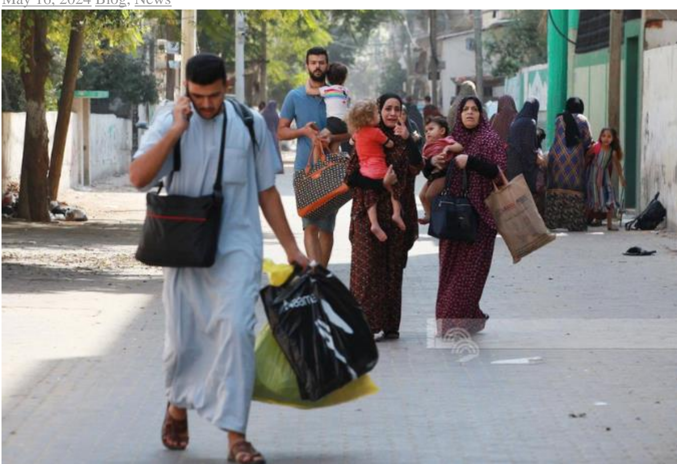
Israel continues to carry out massacres against Palestinian civilians in Gaza.