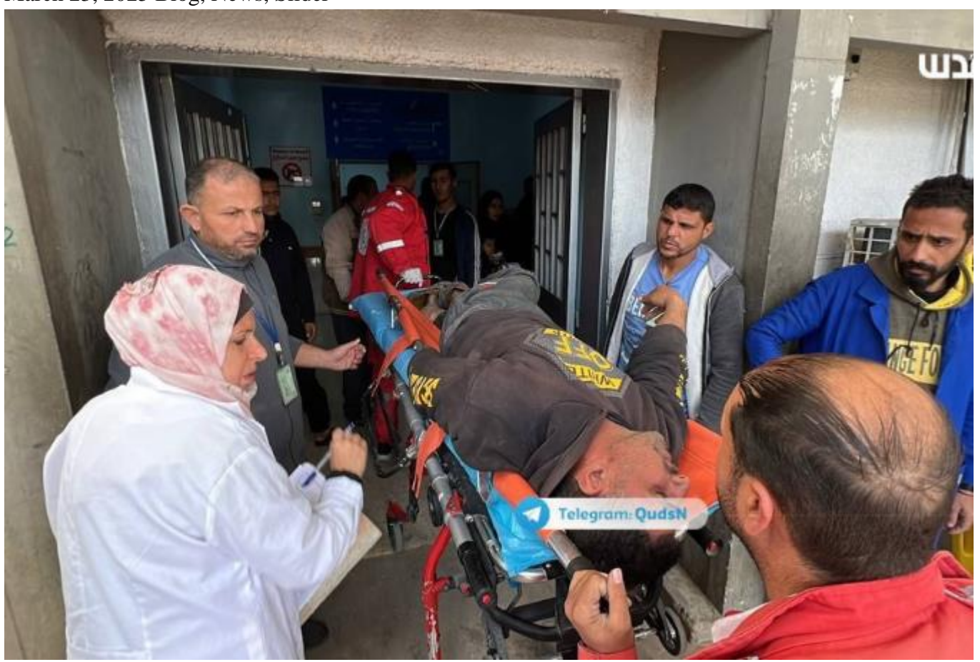
Hundreds of Palestinians were killed in Israel's latest attacks on Gaza. Share